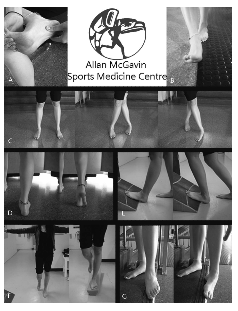
FIGURE 1. Composite illustration of the 7 exercise components included in the multielement treatment protocol: A, tissue-specific plantar fascia stretch; B, balance walking; C, karaoke sidestepping; D, forefoot extension exercise; E, calf stretch with aid of sloped surface; F, single-legged balance exercise; G, ankle inversion/ eversion exercise.

trained physician (J.T.) with more than 30 years' clinical experience. The steroid injection procedure has been described previously in the literature.<sup>10</sup> A 22-guage, 1.5" needle, and 3-cm<sup>3</sup> syringe filled with 1 mL of dexamethasone mixed with 0.5 mL of 1% lidocaine was prepared. Before injection, the skin was sterilized with povidone–iodine. The needle was inserted 2–3 cm anteromedial to the focal point of pain in the inferior heel near the calcaneal tuberosity and moved toward the most tender area. Both feet of participants with bilateral plantar fasciopathy were injected during 1 appointment. We advised participants to avoid running and other high impact activities for the 2 weeks after the injection.